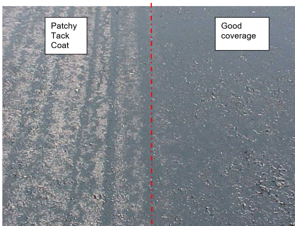
Figure 4 Tack Coat Application Examples