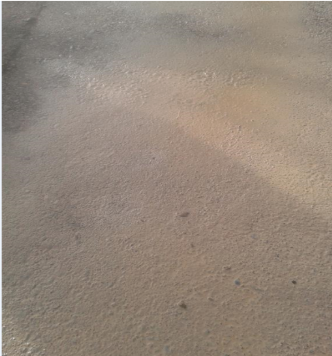
Figure 3 Aggregate wetted down during compaction to achieve 98% of MDD – note no compaction depression lines